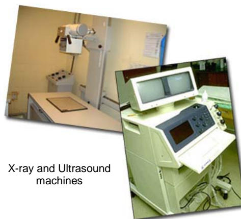
X-ray and Ultrasound machines

Cancer is often suspected from clinical signs, particularly physical examination by your veterinarian. X-rays and ultrasound are often helpful to detect tumors. Blood samples may indicate anemia but this is not specific and only a few tumors will have cancer cells in the blood.