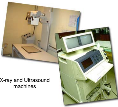
X-ray and Ultrasound machines

The histopathology report typically includes the name of the tumor and a prognosis (what will probably happen) that includes an indication of the probability of local recurrence.