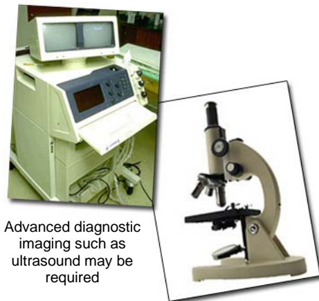
Advanced diagnostic imaging such as ultrasound may be required

Treatment for adrenal medullary tumors is surgical removal of the tumor.