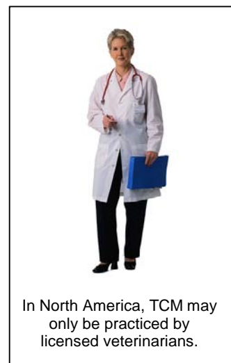
In North America, TCM may only be practiced by licensed veterinarians.

Practitioners of veterinary TCM should possess the necessary training and experience in this form of medicine. In North America, as veterinary TCM becomes more accepted, there are an increasing number of veterinarians in private practice who possess the necessary training and experience. In many cases, referral is not necessary.