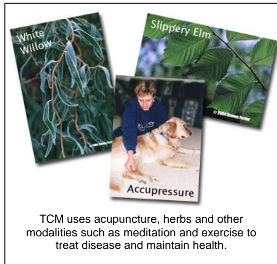
TCM uses acupuncture, herbs and other modalities such as meditation and exercise to treat disease and maintain health.

The Chinese medical view is that each living creature is a small part of the infinite universe, and is subject to the same laws that govern the rest of the cosmos. Therefore, an understanding of health requires an understanding of the laws of nature. The practitioner views health as a state of harmony existing between the internal environment of the body and the external environment it lives in. Unfavorable climactic conditions, emotional upset, physical trauma, infectious organisms, poor nutrition, inappropriate lifestyle, heredity, and other pathogenic factors are capable of disrupting this state of harmony.