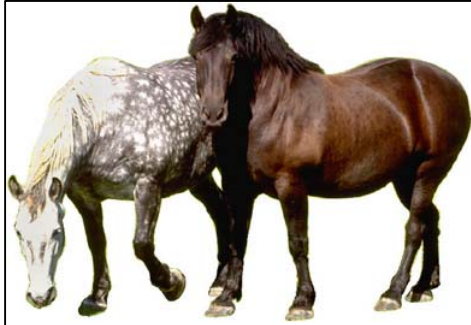
Horses have been treated with magnetic field therapy for many decades.