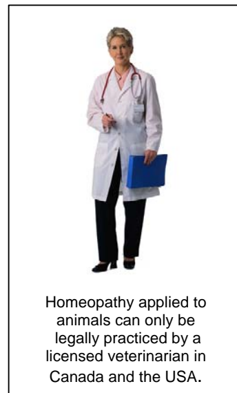
Homeopathy applied to animals can only be legally practiced by a licensed veterinarian in Canada and the USA.

Samuel Hahnemann later proposed that chronic diseases were also caused by the invasion of an external force, or 'miasm'. Symptoms that arise in response to this invasion represented to Hahnemann the enduring action of this miasm on the body. Some modern practitioners consider chronic disease symptoms as merely an initially constructive response to disease that has become enfeebled and ineffective over time. Chronic diseases from the homeopathic perspective include most common disease syndromes such as allergies, arthritis, skin problems, digestive disturbances, respiratory problems, musculoskeletal problems, organ disease, and cancer.