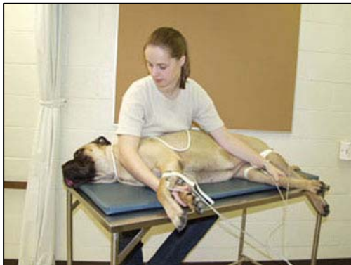
Gentle restraint is usually all that is necessary for acupuncture in pets.

Because of the differences in anatomy, and the potential for harm if the treatments are done incorrectly, only a properly trained veterinarian should perform acupuncture on animals. The American Veterinary Medical Association and the Canadian Veterinary Medical Association both consider the practice of acupuncture to be the practice of veterinary medicine, and as such, should only be performed by a licensed veterinarian.