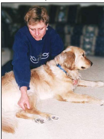
Acupressure Training

The term acupuncture is from the Latin, “acus” meaning ‘needle’ and “punctura” meaning ‘to prick’. Acupuncture, in its simplest sense, is the treatment of conditions or symptoms by the insertion of very fine needles into specific points on the body in order to produce a response. Acupuncture points can also be stimulated without the use of needles, using techniques known as acupressure, moxibustion, cupping, or by the application of heat, cold, water, laser, ultrasound, or other means at the discretion of the practitioner.