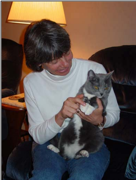
Acupressure Training Photos courtesy of Tallgrass Animal Acupressure. www.animalacupressure.com

Acupuncture should never be administered without a proper veterinary diagnosis and an ongoing assessment of the patient's condition and response to any prior treatment. This is critical because acupuncture is capable of masking pain or other clinical signs and may delay proper diagnosis once treatment has begun. Elimination of pain may lead to increased activity on the part of the animal, thus delaying healing or worsening the original condition.